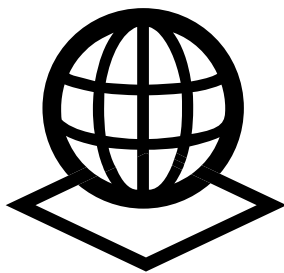
'Sphere On A Plane'

The initial idea is to depict PROJ software actual purpose visually, in the simplest form.